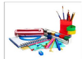
Kits for Kids allows girls and boys to assemble school supply kits for children living in poverty around the world.

UMCOR -United Methodist Committee on Relief is a not-for-profit international humanitarian aid organization providing relief from hunger and disasters and teaching