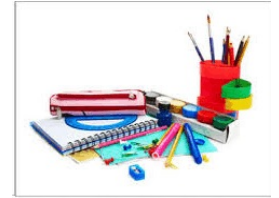
Kits for Kids allows girls and boys to assemble school supply kits for children living in poverty around the world.

UMCOR -United Methodist Committee on Relief is a not-for-profit international humanitarian aid organization providing relief from hunger and disasters and teaching peace. Besides monetary support, Northview contributes kits for health, school, sewing, etc. and NV members have been on work teams in disasters. For 75 years, UMCOR has been in ministry with the most vulnerable by being present with and offering relief to those who have been displaced by war, other conflicts, or natural disasters. We are the globally connected United Methodist family journeying with communities on the long road to recovery and development, responding to the spiritual and emotional needs of those who find their lives turned upside down by disasters, and compelled by Christ to offer hope and healing to a hurting world. That's the community of faith that sends UMCOR out into the world.